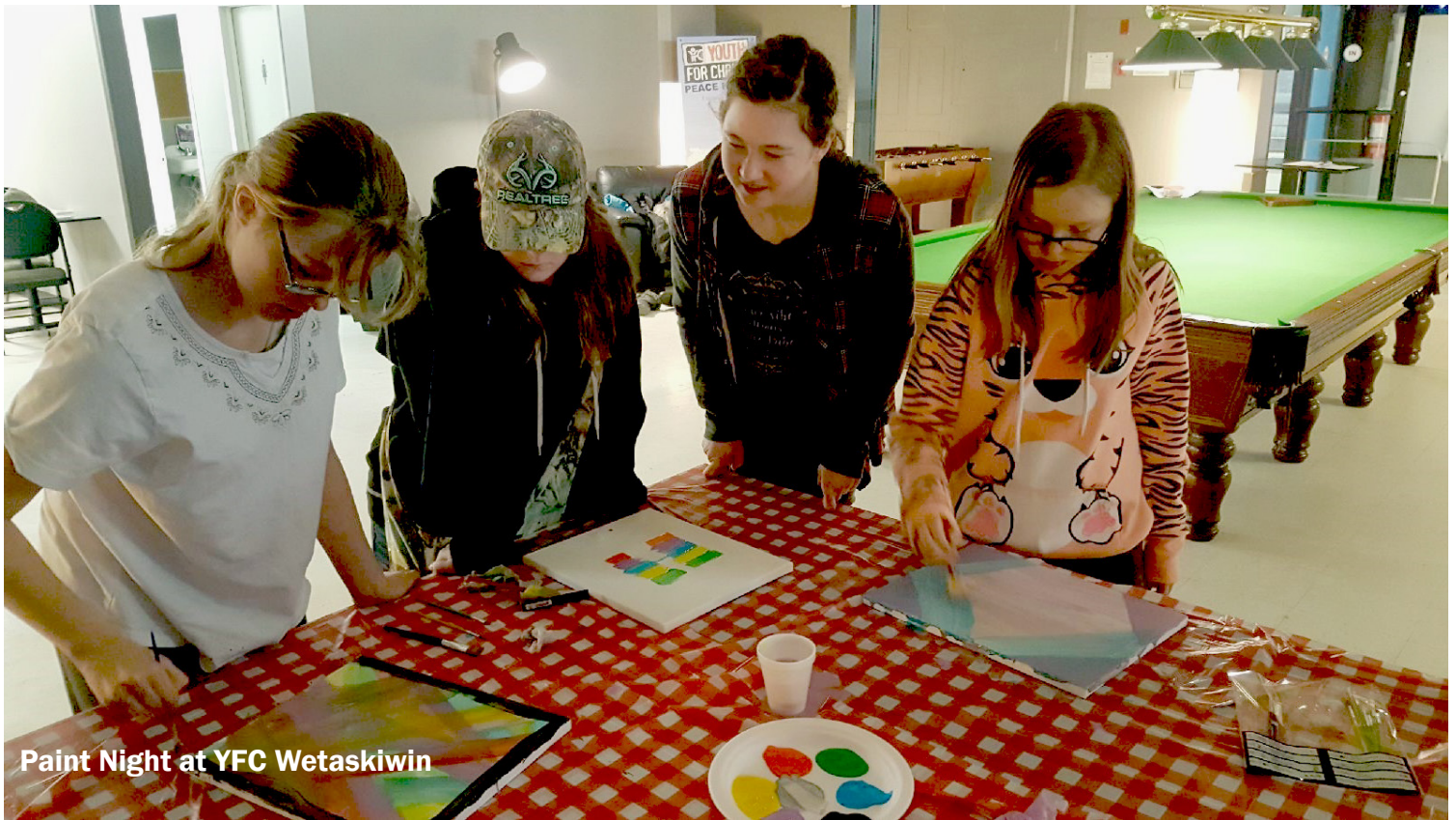
Paint Night at YFC Wetaskiwin